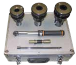
PV60 Replacement Kit